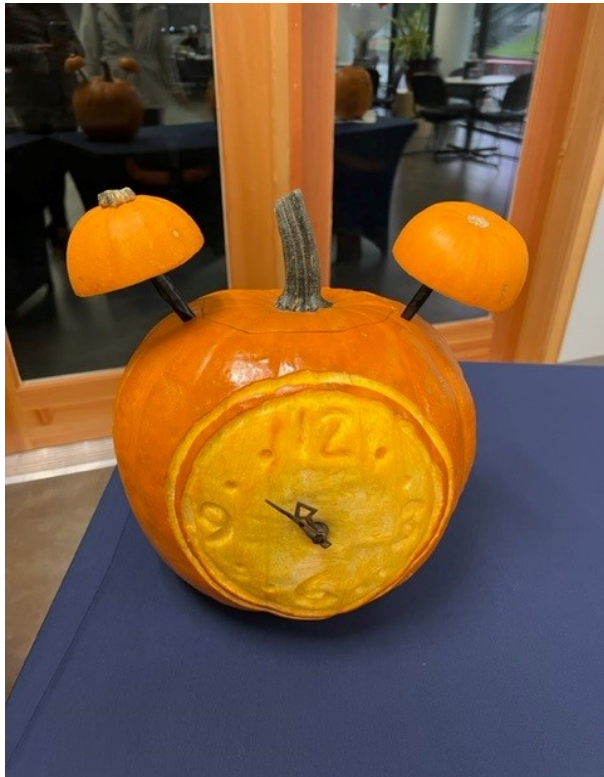
2022 Contest Winner – The President's Office