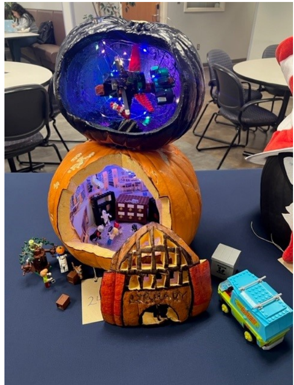
2022 People's Choice – The Library